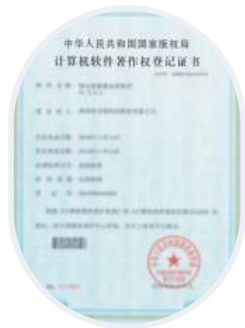
National Copyright Administration of PRC Computer software copyright registration certificate